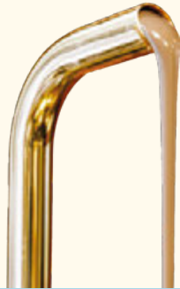
MILK CHOCOLATE 35%