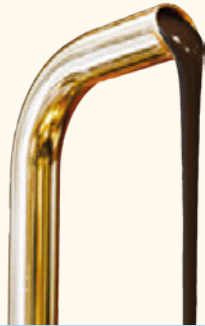
DARK CHOCOLATE 70%